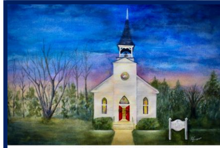
SHERWOOD U.M. CHURCH

For more information contact: dbrookhouser@gmail.com