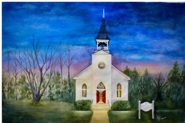
SHERWOOD U.M. CHURCH

Please join us on Sunday, September 3rd for our 8:30 AM service at Sherwood United Methodist Church. All are welcome