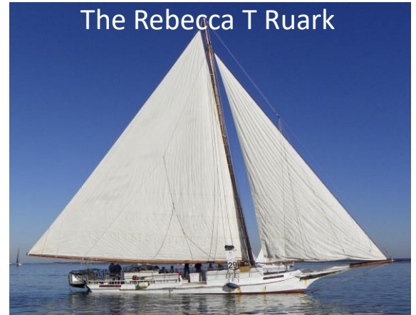
The Rebecca T Ruark