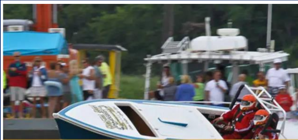
Thunder on the Choptank Boat Races July 23 @ 10:30 am - 5:00 pm

Live music, rowboat race, anchor throw, boat docking contest, workboat races, crab picking contest, oyster shucking contest, Watermen's auction