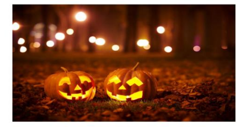
Saturday October 30th 6pm - until

Live Music 6pm-8pm featuring Endless Ember