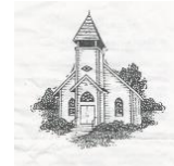
Friends of St. Johns Chapel

HOURS MON-THURS 12pm-5pm *Lunch Menu THURSDAY 5pm – 9pm FRI-SAT 12pm – 9pm SUNDAY 11am – 8pm Happy Hour at the bar FRIDAY 3pm – 5pm 1/2 off Specialty Cocktails Music FRIDAY 7pm-9pm SUNDAY 12-3pm Call 410-886-2121