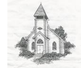
Friends of St. Johns Chapel

TUMC Services Sundays @ 10:00 AM Vacation Bible School August 1-5 at 6:30 - 8:00 pm