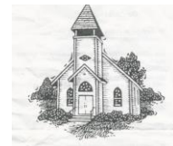
Friends of St. Johns Chapel

St. John's Chapel Worship Services May 2 nd & May 16 th 10:00 AM