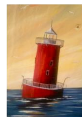
Sharpe's Island Light House on Canvas